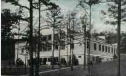
Heber Springs High School Building

Photographs of historical schools in the County