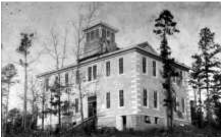
Edgemont School Building