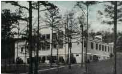
Heber Springs High School Building

Photographs of historical schools in the County